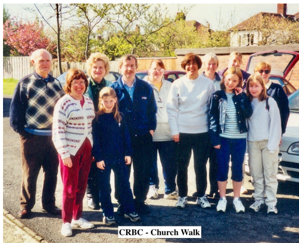
CRBC - Church Walk

a "Car Treasurer Hunt" involving several non-members. Another special even was having the local youth band that rented the church hall for practices play for a Sunday Worship service. This resulted in many non-members attending worship. A team was established to arrange activities to include non-members in the age 35 to 45 group. We were able to accomplish some building upgrade work including painting the church hall with all the labor provided by church attendees some of which were not members but loved the church very much. CRBC considers fellowship an important part of church life and arranges an annual weekend away for its members and friends.