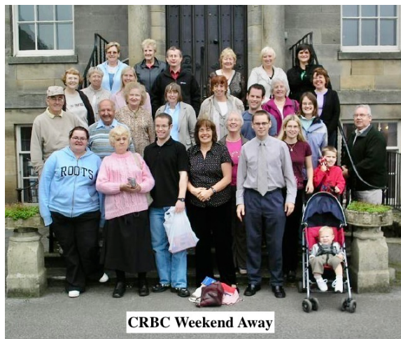
CRBC Weekend Away