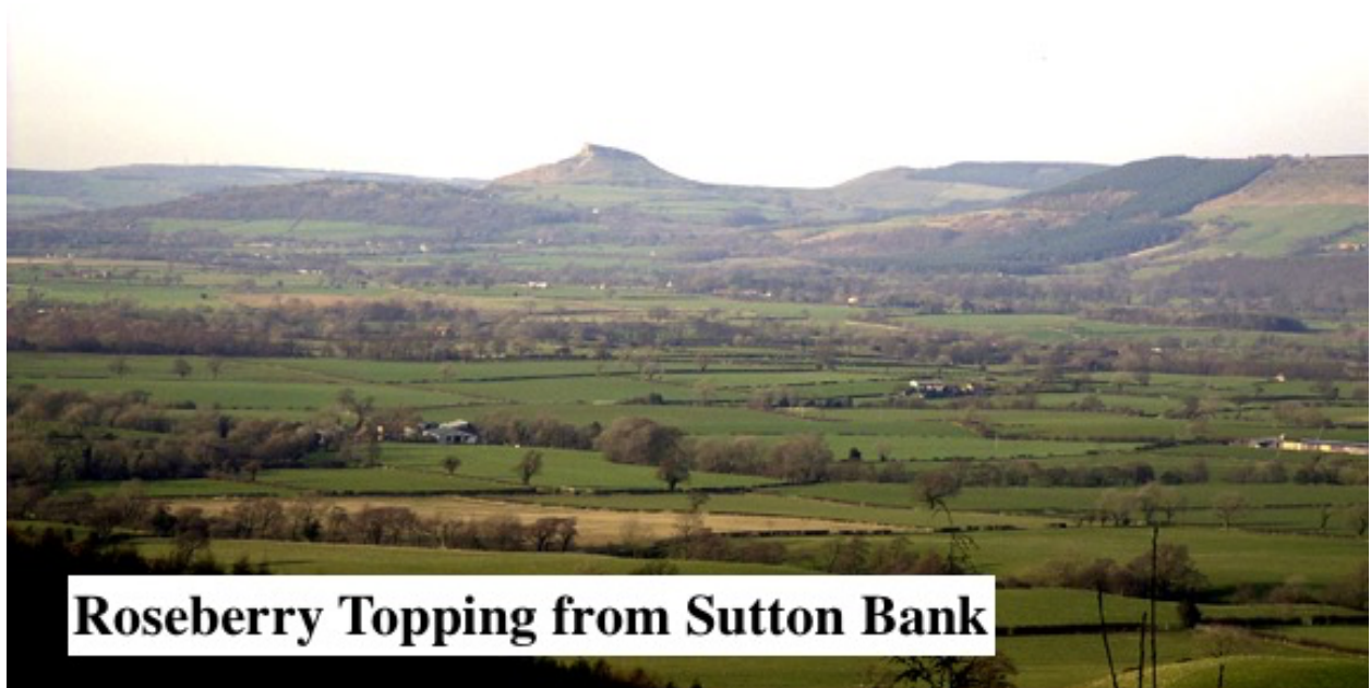
Roseberry Topping from Sutton Bank