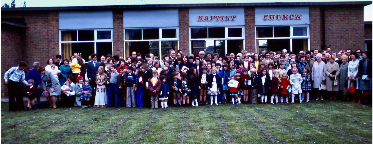
5/28/1977 Middlesbrough Baptist Church. AKA: Cambridge Road Baptist Church.